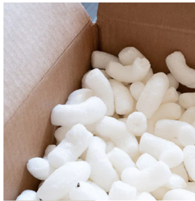
BIODEGRADABLE PACKING PEANUTS