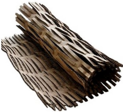
RECYCLES CORRUGATED BUBBLE ROLLS