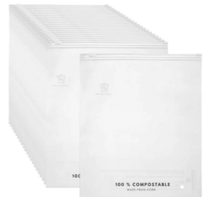
100% COMPOSTABLE CLOTHING BAGS