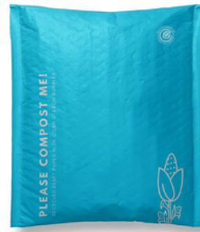
100% COMPOSTABLE BUBBLE MAILERS