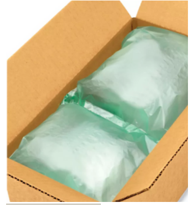
ECO-FRIENDLY GREEN AIR PILLOW FILM