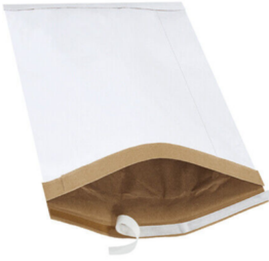
SELF-SEALED PADDED MAILERS