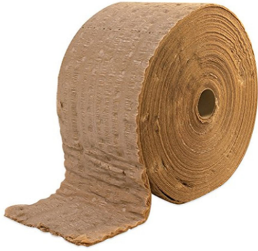
VERSA-PAK KRAFT WADDING ROLLS