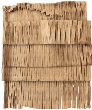
ORNAMENT PAPER SHRED