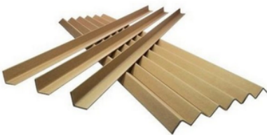
AMS "ONE MORE LIFE" CORNER PROTECTOR CARDBOARD EDGE GUARD