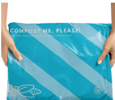
100% COMPOSTABLE POLYMAILERS