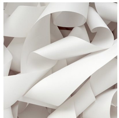
AMS "ONE MORE LIFE" LABEL BACKING DUNNAGE