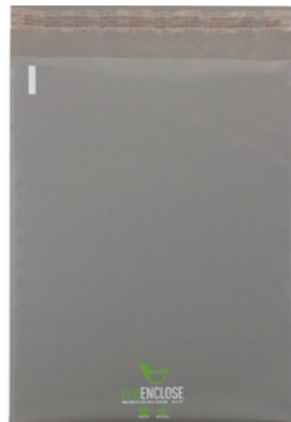
100% RECYCLED POLYMAILERS