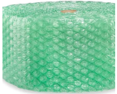
UPSABLE ECO-FRIENDLY BUBBLE ROLLS