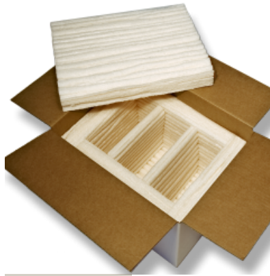
BIODEGRADABLE FOAM SHEET PROTECTORS