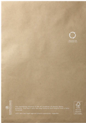
100% POST CONSUMER KRAFT MAILERS