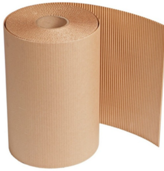
CORRUGATED FLUTED WRAP ROLLS