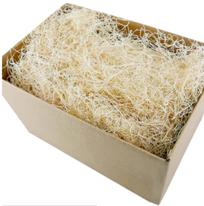
BIODEGRADABLE UNDYED ASPEN