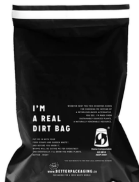
COMPOST PACKS BLACK BAGS