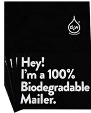
100% BIODEGRADABLE POLYMAILERS